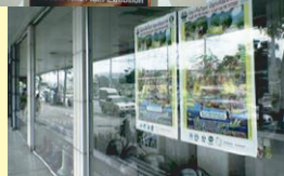
banners and signboards