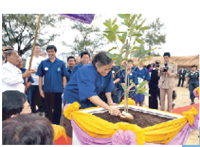
HRH Princess Sirindhorn launched the tree planting project with planting five kinds of seedlings, on July 19, 2008, in the Launching Ceremony, held at The Sirindhorn International Environmental Park (Cha-am, Petchaburi Province).