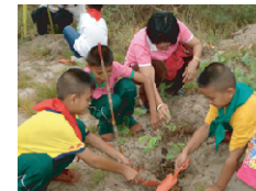
After the launching, more than thousands of school children, university/college students, boy and girl scouts and Thai citizens, continuously planted trees in The Sirindhorn International Environmental Park for the first phase of the project in 2008.