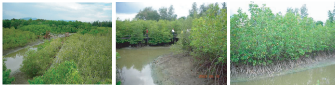
Under HRH Princess's great leadership, a project of improving a huge devastated land and tree planting has started. With continuous efforts for years, beautiful mangrove forests have been reviving.

One of the main purpose of "Forests for the Future Project" is to make children and young people be aware how important it is to plant trees, as well as how wonderful it is to work in harmony, together with other people, for preserving their precious environment. The Project raises children's ecological mind with cooperation of local schools and communities, and enhances them to take actions for preserving their beautiful homeland for future generations.